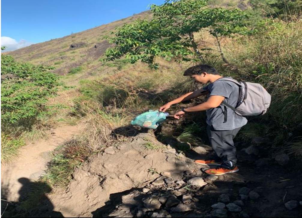
Figure 3. Hikers unloading plastic waste from the top of Mount Batur

Looking at the current environmental conditions, it certainly feels increasingly alarming. This can be caused by the tendency of humans who understand the consequences but deliberately over-exploit natural resources. Conditions like this are certainly closely related to human behaviour which tends not to care about the condition of natural resources and the environment that is maintained in its sustainability. Therefore, human behaviour and character is an important and main priority in overcoming the current environmental crisis. The photo in Figure 3 was taken when a group of young climbers unloaded their personal waste and collected the plastic waste left by the previous climbers according to the load that could be carried down and finally the garbage was collected at the ticket post.