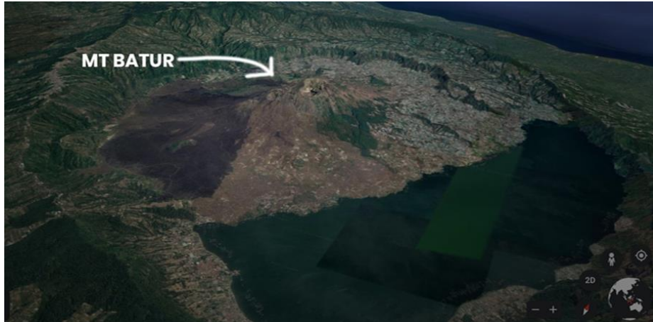
Figure 2. Appearance of the peak of Mount Batur

Due to the relatively normal climbing time, it is very suitable for beginners, only because the terrain is quite heavy, complete preparation is needed, starting from physical health, adequate logistics, warm clothes, shoes that match the natural terrain, flashlights and climbing sticks. According to Witarsana et al (2017) there are many things that motivate the wider community to climb Mount Agung, namely wanting to get a different atmosphere, wanting to do new things such as mountain trekking and wanting to relax at the top with beautiful and calm views.