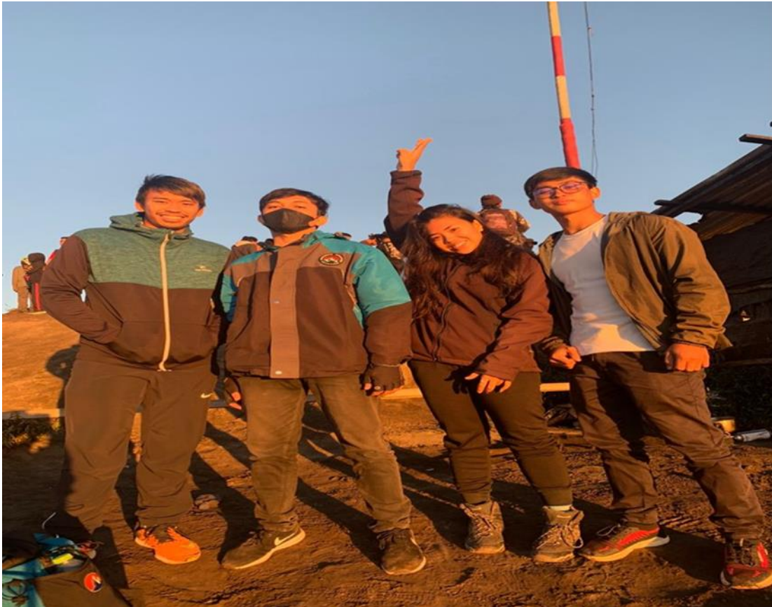
Figure 4. Climbing Mount Batur by keeping it clean from garbage.

The condition of the peak of Mount Batur is dense because there is no information about how many people climb on May 15, 2021. Many climbers enjoy the beauty of the sunrise at the top resulting in soil conditions or some points being damaged and this is very dangerous for the safety of climbers, this is which is the background that data collection on the number of climbers every day is very important so that related parties know the ideal number of climbers per day for the preservation of the nature of Mount Batur and have an impact on the comfort and safety of climbers.