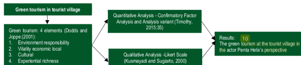
Figure 1. Methodology design

Afterwards, the Confirmatory Factor Analysis (CFA) was used to prove whether the Penta Helix actors' perception of the implementation of the GT in the tourist village is significantly or insignificantly influential. The local people's perception of the GT in the tourist village is represented starting from variable X1 to X20 adopted from the four factors determined. After the four common factors (elements), namely the environmental responsibility factor (F1), the vitality of the economic factor (F2), the vitality of the cultural factor (F3), and the experience achievement factor (F4) were determined, several results of the confirmation test were obtained. It is through this factor analysis,