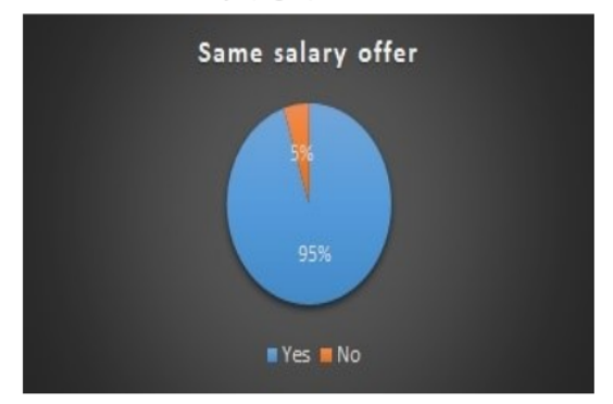
Fig. 4. Same salary offers.

Graduated women workers from Tourism Department got the same benefit as the men workers got from their work. Graduated women workers get salary offers the same as men workers. There is no discrimination for women workers regarding the work they did. Related to the benefits obtained by women workers, those who work in international, national or local companies did not get gender gaps. The utilization of facilities provided by companies for positions held by women workers were also the same as men workers. Implementation of the law of labor that provided equality between men and women workers, can be said well implemented [15], so that greatly influence the reduction of gender inequalities that occurred in the tourism industry (Fig. 4).