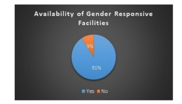
Fig. 3. Availability of gender responsive facilities.

Fig. 2. Graduated women workers participation at work.