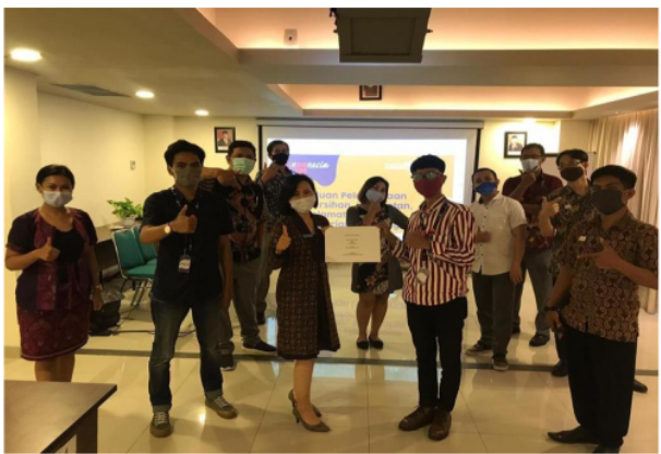
Figure 2. Certification of Tijili Benoa Curated Artotel

The CHSE program which is running in Tijili Benoa Curated Artotel still follows the guidelines given by WHO, however over time the Ministry of Tourism and Creative Economy has also launched through the "We Love Bali" campaign on October, 14 2020, as a form of education as well as a campaign implementation of CHSE based healt protocol for tourism businesses and the economy of the people and society in Bali. Through this campaign, it is hoped that it can form a 'safety awareness' which is slowly being created in the mindset of business people in Bali and also tourists.