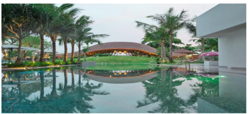
Figure 1. Tijili Benoa Curated Artotel

It is hoped that the program has been carried out this CHSE certification Tijili Benoa Curated Artotel can still maintain their existence so as to increase the level of guest visits who stay in Tijili Benoa Curated Artotel. It is hoped that through this research the Tijili Benoa Curated Artotel can be used as an example in the future for other hotels to implemented this CHSE program, this CHSE program can be informed to tourists through marketing in online media regarding the implementation of health protocols that have been verified by the government. In times of a pandemic like this, information through alline media that is accurate and clear is able to motivate tourists to visit. This is in line with research conducted by (Sulistya et al., 2021) which explains that to increase the number of visits during the pandemic, it is necessary to provide more intensive information about the existence, programs, and attractions provided by management so that they can maintain their existence together in increasing the rate of hotel room occupancy visits in Bali, and it is hoped that so will all hotels in Bali can increase the visits of in-house guests.