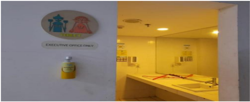
Figure 4. Tijili Benoa Curated Artotel facility with the CHSE Protocol (2)

Almost all sectors of the tourism industry in Bali are trying to carry out the CHSE certification program. Where several things are being done by Tijili Benoa Curated Artotel in supporting the current CHSE program are: