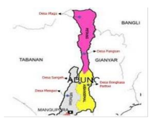
Fig. 1. Research location

The research was conducted in five tourist villages in the Badung Regency area, namely: Bongkasa Pertiwi Village, Plaga Village, Mengwi Village, Sangeh Village, and Pangsan Village (figure 1). The data was collected using a focus group discussion (FGD) involving components of the tourism village as the object. The research informants consisted of the village head, village leaders, the chairman of the Pokdarwis, and tourism practitioners.