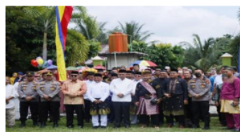
Figure 4. Rumbio indigenous people

These bans have been around for a long time, but nothing can eradicate one or more of these local legacies of wisdom. These prohibitions will allow the community to preserve the forest and protect it for future life. For those who violate it, the presence of this ban would also allow for fines. Hand clenched, shoulder to shoulder, is also strongly applicable to the simple prohibition. If there is a violation of this customary prohibited forest, then customary elders such as ninikmamak will judge him in a friendly and fair manner (Ritonga & Mardiansyah, 2014)