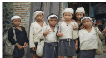
Figure 2. Baduy Tribe Resource https://dispar.bantenprov.go.id/

Geographically, the Baduy people live in the southern part of Lebak Regency, Banten Province, where the topography is mostly hilly. Settlements are usually located in hill valley areas, in flatter areas close to groundwater sources or rivers. This tribe is administratively included in Kanekes Village, with 5,101.8 hectares (Setioaji, 2010) and 11,699 people in 2021 (BPS Kabupaten Lebak, 2019)