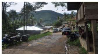
Figure 3. Nagari simanau

The NagariSimanau communally owns the status of ownership of the forest area. This is a way to make forests still managed sustainably by customary provisions that have been mutually agreed upon (Hamzah et al., 2016). However, it may be owned individually for land designated for residence or housing and comply with the administrative laws that apply in Indonesian territory. Although individuals own the residential land, NagariSimanau regulates and forces its people to sell land to people from NagariSimanau. It is strictly prohibited to sell land to people outside Simanau (Hamzah et al., 2016). The prohibition on the community not to sell land to outside parties is indirectly a form of protection of resources and existing norms. The dependence between the forest and the community makes the community have a good perception of the forest in their village, so that the community plays a role in maintaining the sustainability of forest resource with the values and norms/rules in the management of forest resources. This is indicated by the still good forest performance (density, number of species, species diversity, and volume of trees per diameter class) in reserved and prohibited forests.