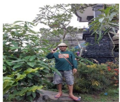
Figure 5. A local compound in Sangkan Gunung village utilized as a homestay for tourists

The house where the local people live can be utilized as a homestay for tourist with the concept of home sweet home in which the tourists can be the family member as they live in one compound.