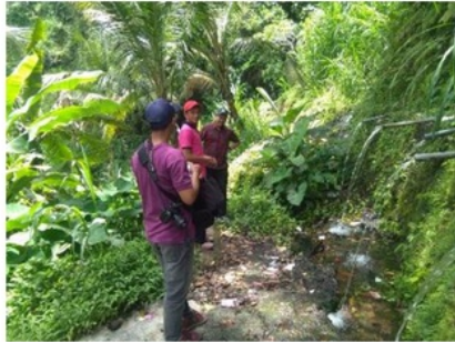
Figure 1. Spring Water Mumbul and Tunjung Kuning Sangkan Gunung Village

Potential that might be developed in rural area tourist attraction is about the natural resources and natural beauty as well as art and culture. Based on observations that have been done, the potential that existed in several rural areas' tourism in 4 subdistricts of Bali Province, such as Belimbing village, Gunung Salak, Timpag in Tabanan Subdistrict, Sangkan Gunung, Tri Eka Buana in Karangasem, Wanagiri, Munduk villages in Buleleng, and Sala village in Bangli. Those villages represent rural areas which possess the treasure of potential to be developed as a tourist destination with their charms including the natural beauty where it is located at an altitude of approximately 800 until 2000 meters above sea level is surrounding by panoramic natural beauty with the background of Wide Lakes, valleys, mountains, rice terraces. It provides an individual value for the tourist especially for those who love nature and enjoy the local cultural experiences. The Natural beauty can be offered to the tourist for the potential value of a place to take pictures or even organize a pre-wedding photo shoot for bride and groom who want a background of the natural beauty for their pre-wedding theme. In addition, a purification ritual can be done from fresh spring water which in Bali the water is believed to have the power of healing as it is shown in figure 1.