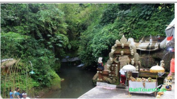
Figure 2. Pura Pecampuhan Sala

The natural beauty of hidden hill with a marvelous view where some leisure activities, such as treetop sling, jungle trekking, and hiking.