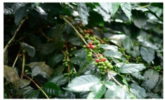
Figure 4. Coffee plantation in Wana Giri village

The house where the local people live can be utilized as a homestay for tourist with the concept of home sweet home in which the tourists can be the family member as they live in one compound.