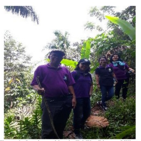
Figure 3. Jungle tracking in Tri Eka Bhuana Village

The natural beauty of hidden hill with a marvelous view where some leisure activities, such as treetop sling, jungle trekking, and hiking.