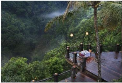
Lembah Ayung Jetty

4 higher risk of suffering from the negative effects of Covid-19 (Bostan, 2020). Covid-19 is a global disease that causes strict restrictions and closures in many countries in the world. The covid-19 pandemic caused important collapses in many sectors, such as tourism, which is among the sectors that are affected by Covid-19 (Bayat, 2020). The pandemic that has occurred for a year has made it very difficult for tourism to rise. Many hotels in Bali minimize human resources, services, and are even forced to close their hotels, including hotels in the Ubud area. Ubud is an area that has become a favorite list of tourists when visiting Bali. Ubud is also affected by Covid-19 pandemic. The impact of Covid-19 has made hotels that are still operating must have various strategies to promote their hotels, including Pramana Watu Kurung Resort Ubud.