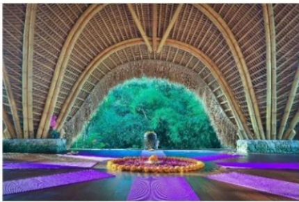
Surya Puja Yoga Shala