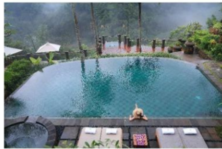
Public Infinity Pool