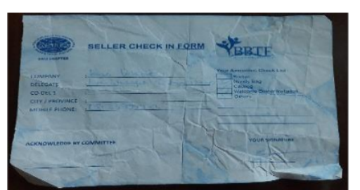
Figure 4. Seller check-in form

IJASTE – International Journal of Applied Sciences in Tourism and Events Vol.2 No.2 December 2018