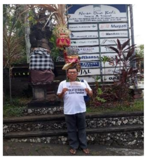
Figure 7. The tour guide shows the names of the client to be picked-up for the guide order.

In addition, Bagus Discovery also operates Nusa Dua Bali Tours and travel with various tour products including organizing events which is commonly termed as MICE. The example of handling an even which was also done by the author was Familiarization Trip (Famtrip) on behalf of BTTF. The process of handling was starting from welcoming the client at the airport for a transfer in, conducting tours until took them to the venue of the event in the BNDCC. Figure 7 shows the tour guide received a guide order in the office.