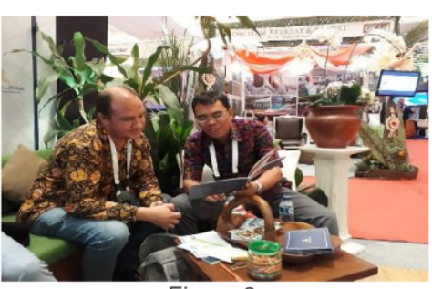
Figure 6. The seller is explaining tourism-industry products to a buyer.

In addition, Bagus Discovery also operates Nusa Dua Bali Tours and travel with various tour products including organizing events which is commonly termed as MICE. The example of handling an even which was also done by the author was Familiarization Trip (Famtrip) on behalf of BTTF. The process of handling was starting from welcoming the client at the airport for a transfer in, conducting tours until took them to the venue of the event in the BNDCC. Figure 7 shows the tour guide received a guide order in the office.