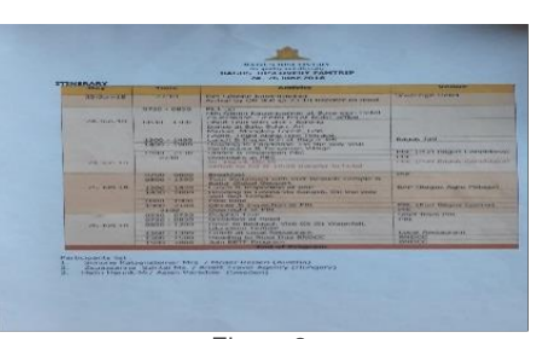
Figure 8. Itinerary Program (Source: Nusa Dua Bali Tours and Travel).

IJASTE – International Journal of Applied Sciences in Tourism and Events Vol.2 No.2 December 2018