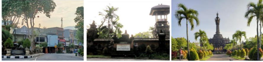
Figure 2. The iconic of places of interest in Denpasar city