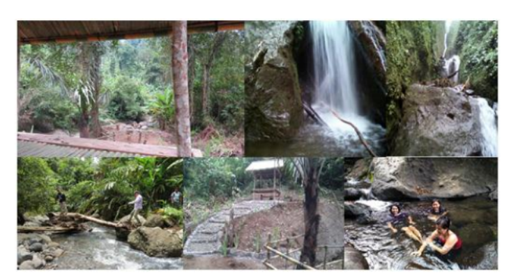
Figure 3: Mesehe trekking - Post 1

In order to maintain the tranquility of the forest that effects the visitors' experience, CBT Pohsanten will apply limit to the number of visitors using Mesehe trek. This limit is applicable to the both trekking routs either for the amateur or the professional.