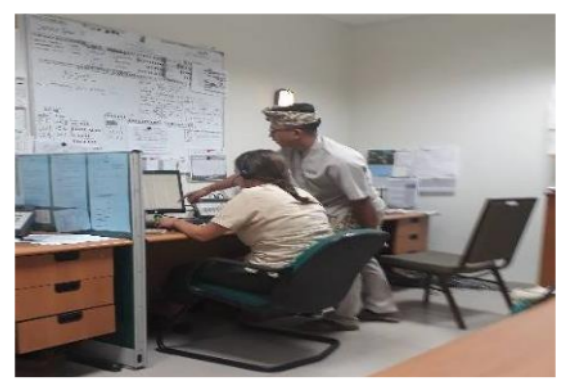
Figure 1. Front office employees are training foreign representatives about hotel product knowledge

Based on the results of tests conducted on The Ritz Carlton Bali Frost Office employees, the results are as shown in Table 2, where the result of product knowledge is very high with a score of 97.7 which is not significantly different compared to English proficiency with an average score of 92.8. The results of these two analyzes can be seen that there is no significant deficiency in terms of master y of English and in terms of SOP already has a very good persuasion style. Product knowledge from front office employees is also very good so that what will be explained to target tourists who want to be upsold becomes even more valid and convincing. This is because if someone understands the product they have, it will be easier for that person to sell the product. Accurate information will provide the real experience of tourists, so there will be no miscommunication which will ultimately have a negative impact on the tourist experience. The ability to master product knowledge of The Ritz Carlton Bali front office employees can also be seen from the way one of these employees explains hotel products to foreign guest relations (see figure 1) who must be trained before working at the hotel.