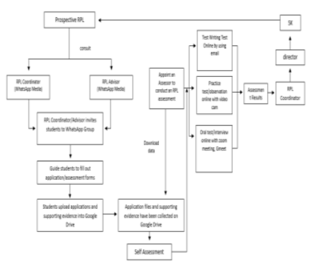
Figure 3 Model for implementing online-based RPL recruitment assessment

The Tourism Busines Management Study Programof the Bali State Polytechnic Tourism Department applies RPL Type A1 (credit transfer assessment) and Type A2 (recognition/recognition of work experience). In its implementation, to make it easier for prospective students to communicate with the RPL coordinator and RPL advisor, a group was created using WhatsApp media. The function of this group is as a medium for delivering information from the RPL coordinator or from the RPL advisor in order to reduce physical encounters with prospective RPL students. Considering that the RPL assessment is a process of collecting evidence of learning achievements that have been obtained by prospective RPL students, in the online assessment a Google Drive is made where all the forms that will be used in the assessment are stored in the drive.