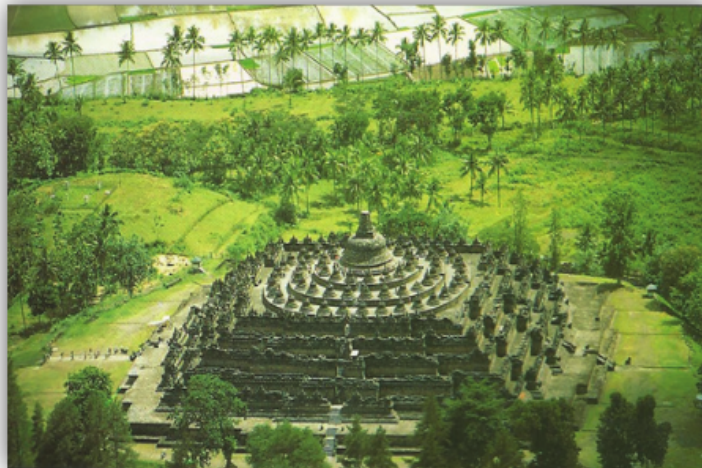
Borobudur in green environment

Known as the biggest complex of Buddhist temple in the world, and the climax of Buddhist art 2 , Borobudur monument has a huge number of reliefs on its walls reflecting the Buddha's life and Buddhism. The walls of its levels are decorated with reliefs, which are approximately 2,500 meters in length, and hundreds of Buddha statues. No doubt Borobudur temple is both forms of art and philosophy present altogether in natural setting. According to historians this temple was built by Sailendra dynasty (the ruler of mountain) of Central Java in 8th-9th century A.D. Notwithstanding, it shows how men and nature produced such high aesthetical, ethical, and ecological values of the Javanese in ancient Java immortalizing the faith and vision of the kings inspired by the Buddha. Being "a prayer in stone" 3 and landmark of Javanese art and culture its spiritual grandeur welcomes every visitor who wants to experience its beauty and magic.