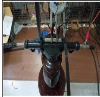
Figure 1. These electrode connected.