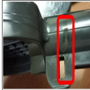
Figure 2. Breakdown voltage gate.

The other data analysed with the same role. The data and output analysis is described at the Table 1.