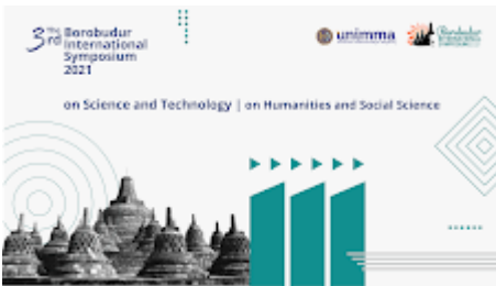
Presenter_Virtual Background.png 877K