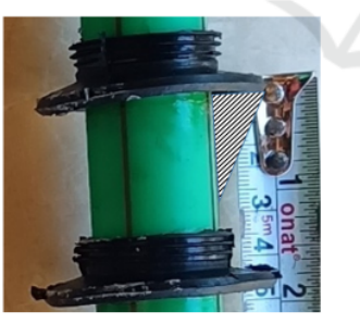
Figure 8: Rubber Ring on The Safety Grounding Shaft.

If the black-shaded triangle in figure 8 to copy and pasted it will be obtained as shown in Figure 9 below.