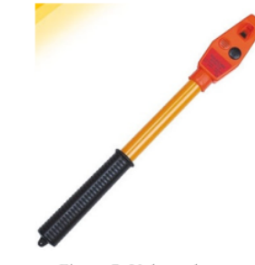
Figure 7: Voltage detector.

working with a voltage of 2.7kV and above like shown on figure 7. Tests were carried out on three ground stick samples that had been assembled, with dry and wet conditions.