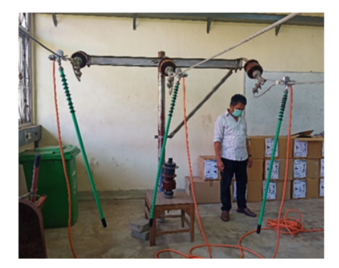
Figure 2: Electrical safety grounding on the trial.

iCAST-ES 2021 - International Conference on Applied Science and Technology on Engineering Science