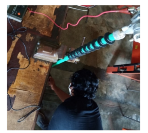
Figure 4: Wet insulation resistance pretest with megger 10,000 volt.