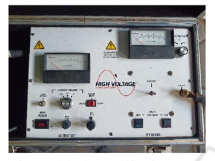
Figure 5: High voltage VLF hi-pot instruments.

is done at PN UP2D Bali Laboratory. High voltage VLF hi-pot instruments are high voltage test equipment with low frequency. This measuring instrument changes the voltage 220 Volt 50 Hz, into a DC voltage, then converted back into low frequency AC high voltage. The output of High Voltage VLF Hi-pot Instruments test equipment Type: VLF 4022 is 40 KV AC with a frequency of 0.2 Hz.