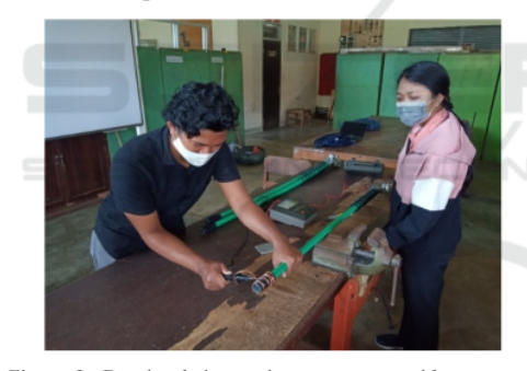
Figure 3: Dry insulation resistance pretest with megger 10,000 volt.

quality this electrical work safety grounding shaft. The pretest is carried out by applying a voltage of 5,000 volts and 10,000 volts to the terminal head and handle connected by grounding trough coil electrode as shown in the following figure 3. Insulation resistance pretest is done in dry and wet condition three times for each sample, the wet condition testing as shown at figure 4.