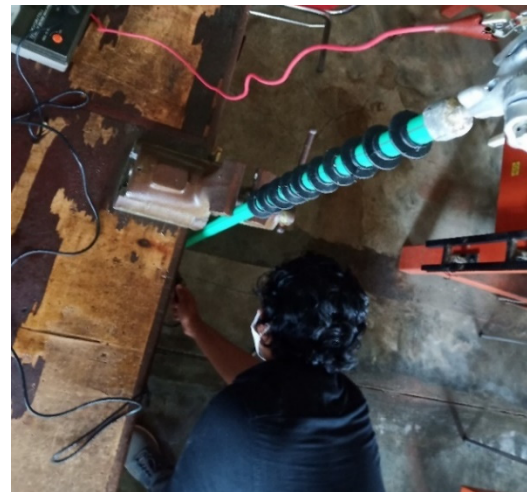
Figure 4: Wet insulation resistance pretest with megger 10,000 volt.