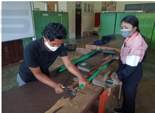
Figure 3: Dry insulation resistance pretest with megger 10,000 volt.

quality this electrical work safety grounding shaft. The pretest is carried out by applying a voltage of 5,000 volts and 10,000 volts to the terminal head and handle connected by grounding trough coil electrode as shown in the following figure 3. Insulation resistance pretest is done in dry and wet condition three times for each sample, the wet condition testing as shown at figure 4.