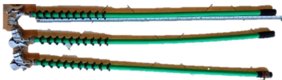
Figure 1: Safety grounding shaft.

The result of this research described by figure and table. The analyses of the feasibility of a grounding shaft was carried out is to guarantee the work safety. Grounding tools must have good ground resistance and the insulated shaft to ensure work safety in the construction, maintenance, repair and improvement of the medium voltage distribution. However, there is no perfect shaft material, therefore the research on this assembled shaft so important. This earthing shaft constructed by polypropylene pipe, which has good electrical characteristics because the coefficient of resistivity volume is 8.5 \times 10^{14} Ohm-cm. Safety grounding shaft was designed like as shown in Figure 1 below.