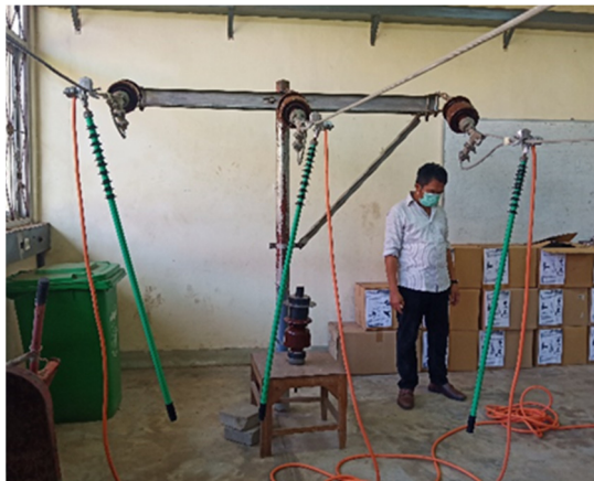
Figure 2: Electrical safety grounding on the trial.

quality this electrical work safety grounding shaft. The pretest is carried out by applying a voltage of 5,000 volts and 10,000 volts to the terminal head and handle connected by grounding trough coil electrode as shown in the following figure 3. Insulation resistance pretest is done in dry and wet condition three times for each sample, the wet condition testing as shown at figure 4.