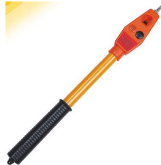
Figure 7: Voltage detector.

working with a voltage of 2.7kV and above like shown on figure 7. Tests were carried out on three ground stick samples that had been assembled, with dry and wet conditions.