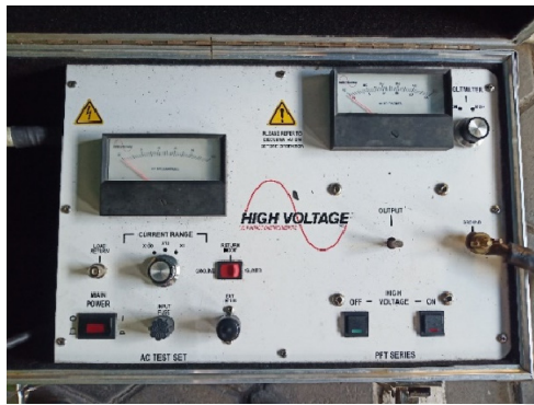
Figure 5: High voltage VLF hi-pot instruments.

is done at PN UP2D Bali Laboratory. High voltage VLF hi-pot instruments are high voltage test equipment with low frequency. This measuring instrument changes the voltage 220 Volt 50 Hz, into a DC voltage, then converted back into low frequency AC high voltage. The output of High Voltage VLF Hi-pot Instruments test equipment Type: VLF 4022 is 40 KV AC with a frequency of 0.2 Hz.