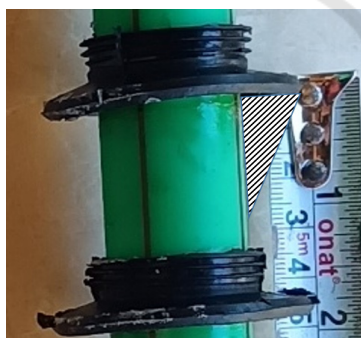
Figure 8: Rubber Ring on The Safety Grounding Shaft.

If the black-shaded triangle in figure 8 to copy and pasted it will be obtained as shown in Figure 9 below.