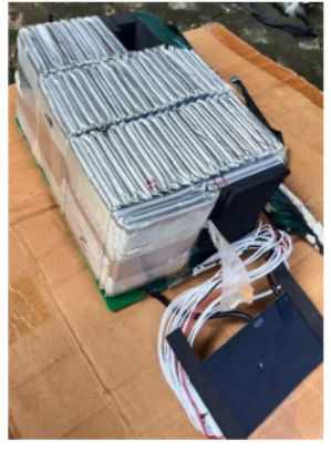
Figure 7: Battery lithium polymer 72 Volts 20 Ah.

BLDC motors have lower efficiency compared to alternating current induction motors, BLDC at nominal speed has an efficiency of about 80% while AC induction motors reach 85% efficiency (Miyamasu and Akatsu, 2013). Thus, 20% of the electrical energy sent to the BLDC motor is lost in the form of heat, iron loss, copper loss, friction loss and so on. Not 100% of the energy that goes into the BLDC motor is used to rotate the rotor.