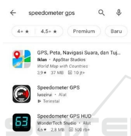
Figure 1: Android speedometer GPS base.

recordings of this journey in various forms, graphs, numbers, even in the form of tracks that ride on the google map application. With this recording, the travel history can be monitored anytime, anywhere and using a variety of devices that support it. This rigid and valid record is very supportive for researchers to analyse and draw conclusions.