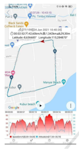
Figure 8: Tracking speed.

of 3,036 km, a maximum speed of 54 km / h and an average speed of 31.5 km/h. Observations were made from the start, the maximum speed was 54 km/h, on the contour of the road varying up and down between 17.30 meters to 30.70 meters above sea level.