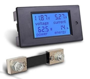
Figure 3: DC digital KWH meter.

Electrical energy consumption (W) is the amount of electrical energy used in 1 experimental sample, this energy measurement is carried out using a DC watt meter in Watt Hour. Measurement of electrical energy consumption is carried out by an indirect measurement system using parallel resistance. From this parallel resistance, a digital KWH meter is installed as shown in Figure 3 below.