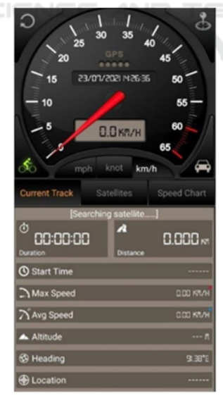
Figure 2: Panel speedometer GPS base.

Weight (W) is the rider's body weight measured in kilograms, this weight measurement is done before they ride an electric motorcycle. To measure the weight of the rider is done using a digital scale with a maximum weight of 200 kilograms.