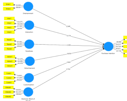
Fig. 2. Bootstrapping (Statistical Testing)

f) The Effect of Trendiness on Purchase Intention: the sixth hypothesis in this study states that trendiness has a positive effect on purchase intention. Table VI present the path coefficient value obtained is 0.704. Meanwhile, the t-statistics and p-values obtained were 2.395 and 0.017, respectively. These results indicate that the sixth hypothesis in this study is acceptable because the t-statistics and p-values obtained have met the requirements, namely above the t-table 1.96 and below the significance level of = 0.05. The results of the calculation of the significance test (bootstrapping) can be seen in Figure 2.