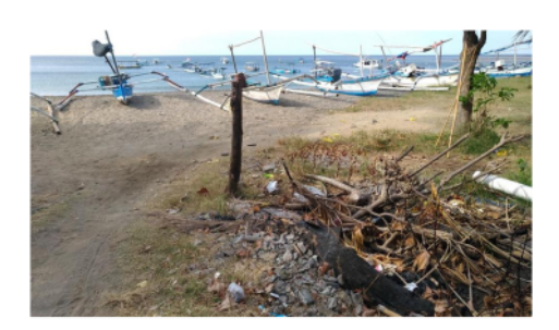
FIGURE 2 . Garbage by the beach

Accessibility : Pemuteran is easy to access because it is located along the main road. However, some of the road towards to the beach is left unmaintained and also blocked by some hotels. Lack of signage to the beach also often leads tourist end up into a dead end road belonging to those big hotels.