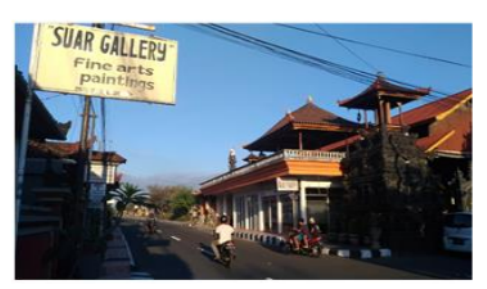
FIGURE 4. One corner of kamasan village

The following is the pemuteran village SWOT analysi