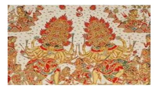
FIGURE 3. Kamasan painting courtesy of museum nyoman gunarsa

by providing road enhancement, cleaning service officers and some other public facilities. Ancillary : A Corporate Social Responsibility (CSR) program by the Ministry of Stated-Owned Enterprises (SOE) is established right in the center of the village helps marketing the village products. The CSR helps to promote the product worldwide by using the flat form of Information and Communication Technology (ICT). This supports the sustainability of the local tradition indirectly. However the office is often left vacant or unattended. The head of Klungkung Regency said that the existence of this CSR has helped to excite artisans and artists to develop creative economic enterprise. This is one strategy to keep and enhance the sustainability of Kamasan local culture. A state-owned bank (Bank Negara Indonesia) offer a non-commercial credit with a very low interest rate. It's aimed to increase the class of the enterprises.