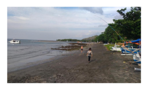
FIGURE 1. Pemuteran beach

has the widest shallow coral reef area in Bali with the safe and quiet waved. Previously, the main job of the local community as source of living was fishermen until 1992 when the first hotel was built.