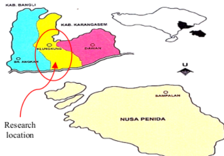
Figure 1. Research location

The approach used in this study is a qualitative approach. The research was conducted in seven tourist villages in Klungkung Mainland, namely: Bakas Tourism Village, Aan Tourism Village, Nyalian Tourism Village, Manduang Tourism Village, and Negari Tourism Village. As is known, Klungkung Regency geographically covers the Klungkung Mainland and Klungkung Islands (Nusa Penida, Nusa Lembongan, and Nusa Ceningan) areas. The research location is presented in Figure 1 below.