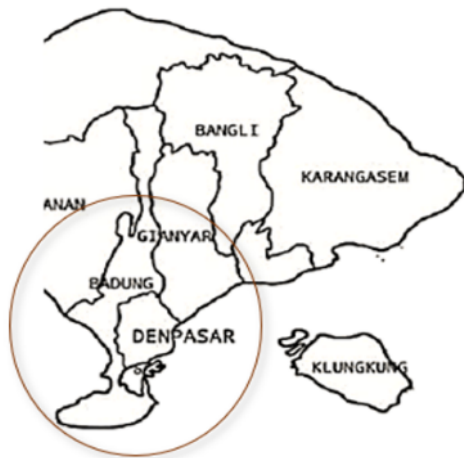
Figure 1. Research Location

Research on the implications of the COVID-19 pandemic on the demand and supply of MSMEs in Bali uses a qualitative descriptive approach. This research was conducted in three areas that place the tourism sector as a top priority in its economic development. The three regions are: Denpasar City, Badung Regency, and Gianyar Regency.