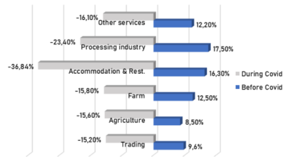
Figure 3. Comparison of Business Margin

The comparison of operating margins before and during Covid 19 is shown in Figure 3.