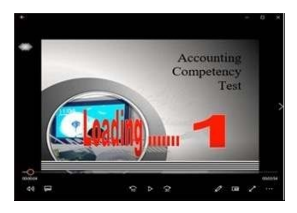
Fig. 1. Initial display of audio visual-based materials.

Before making audio visual-based training material, spreadsheet-based accounting applications need to be made. Spreadsheet-based applications are made using the various features available in spreadsheet applications optimally. entering and editing worksheet data, doing worksheet operations, working with cells and ranges, creating, changing, and working with tables, worksheet formatting, work with formulas and functions, creating charts and graphics, using advanced features, and printing the work. Training materials are more focused on the use of functions and formulas such as text functions, dates and times, count and sum, look up, and financial functions. Some material also needed about using advanced features such as using custom number formats, using data validation, linking worksheets, and protecting. The initial display of audio visual-based training materials is presented in Fig. 1.