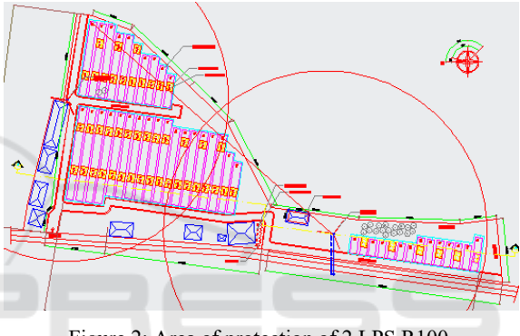
Figure 2: Area of protection of 2 LPS R100.