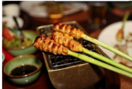
Figure 1. Sate lilit from grated young coconut and chicken or fish

Tepi Sawah is also in Mall Alam Sutera Jakarta. In addition, some of the culinary products above have become the traditional menu of star hotels served to tourists. Some traditional Balinese food served to tourists who stay at star hotels in Bali are ayam betutu , sate lilit , babi guling , jukut urab , plecing buah kacang , tum babi or ayam , sate kakul , and gerang asem .