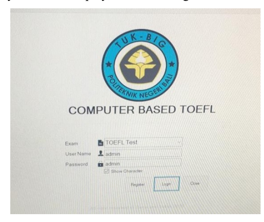
Fig. 2. Initial display.

The following is the display images of the Computer-Based TOEIC application, from the initial display, content display and score display, as seen on Fig. 2-4.