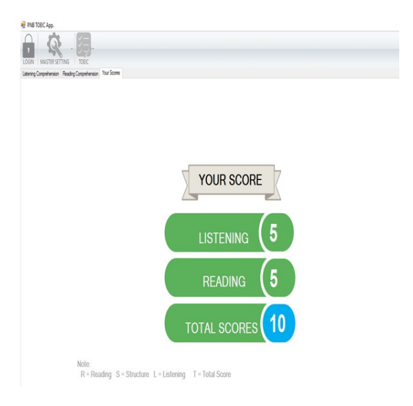
Fig. 4. Score display.