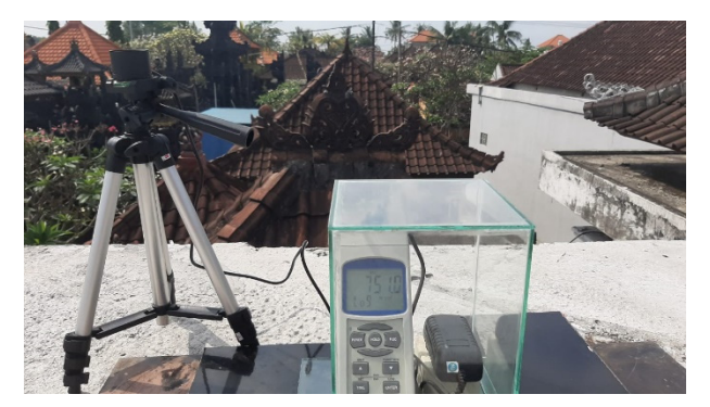
FIGURE 1. SPM-1116SD at Buduk Village.

We collected the solar power data at Buduk Village, Mengwi District (location at -8.608607, 115.160006) and Bongkasa Pertiwi Village, Abiansemal District (site at -8.469633, 115.238608). Both sites are at Badung Regency, Bali Province, Indonesia, separated by 17.62 km. Solar power data was collected from September 2020 to March 2021 on a horizontal surface using SPM-1116SD. The sun moves from the equator towards the December equinox and back to the equator in those months. Figure 1 shows primary data collection regarding solar power in Buduk Village. Primary data is then processed to obtain insolation data in units of Watt-hour per square meter. The data from both solar power meters are then selected every month and processed to obtain the solar energy value and fitted using the Lorentzian Peak Function. After that, we calculate the solar energy value. The last, using the statistics of the Two Samples Kolmogorov-Smirnov test, we compare it by the primary data of solar energy value. Furthermore, we determine the value of the Lorentzian Peak Function parameters to project the solar energy value from September to March in Badung Regency, Bali Province, Indonesia.