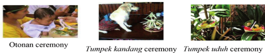
Figure 1. Ceremonies to humans, animals, and plants.

Table 3 explains that sustainable tourism implemented in Bali focuses on four benefits. First, economic benefit that will influence behavior, politics, and community economic activities. The condition could be observed from purchasing power,