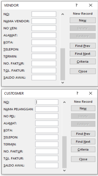
Fig. 5. Vendor and customer form

Vendor and customer information contains names, numbers, addresses, cities, telephone terminals, invoice numbers, invoice dates, and opening balances related to vendors/customers. Inventory information consists of inventory name, inventory number, size, quantity, price per unit, and total. It used to input vendor and customer data along with related payable and receivable balances.